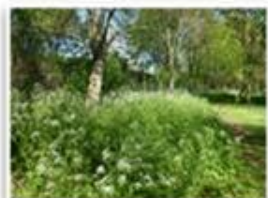
Runcorn wooded area